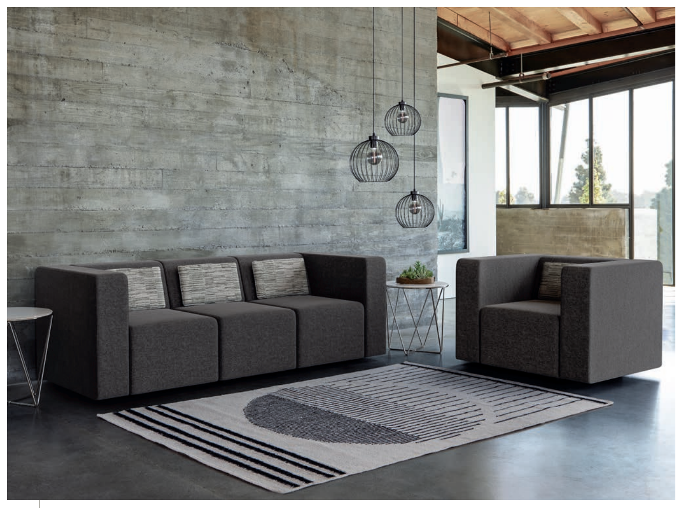
#4803-8LRA Preconfigured Three-Seat Unit and #4801-8LRA Lounge Chair, 8" Wide Arms. Features accompanying Archetype pillows and Betwixt Occasional Tables.