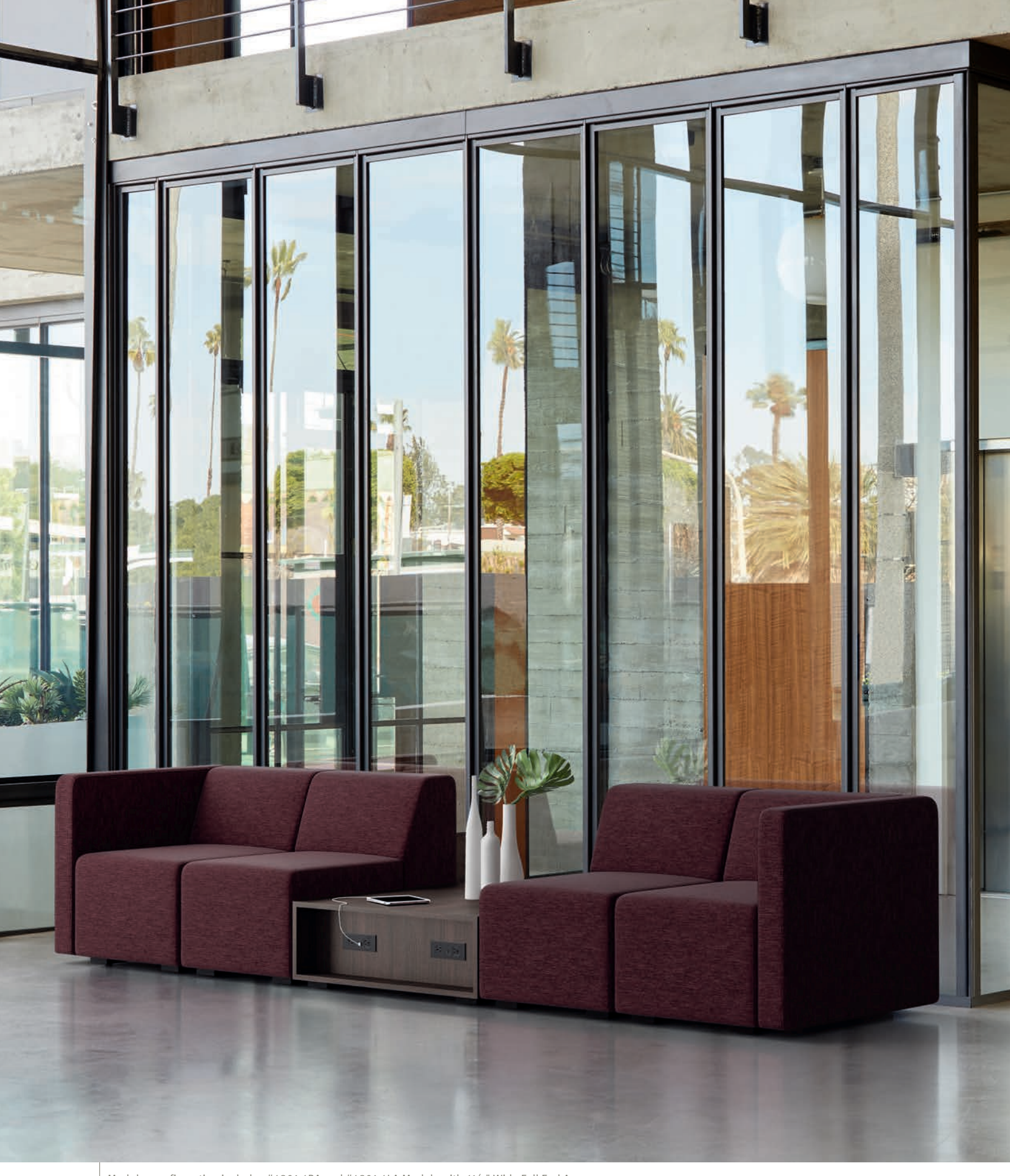
Modular configuration includes #4801-4RA and #4801-4LA Models with 4½ " Wide Full End Arms, #4801 Armless Lounge and #4822 Inline Table