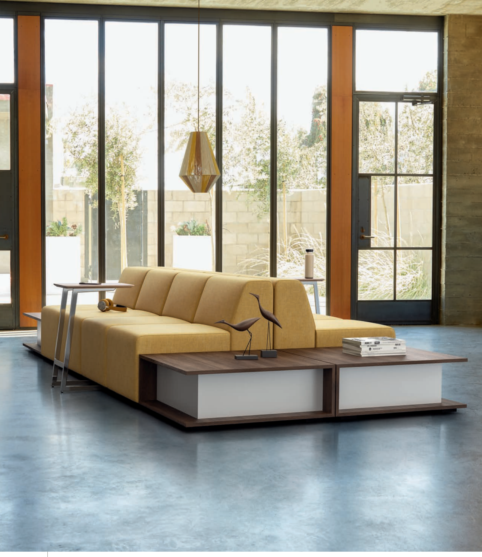
#4801 Armless Units with #4821-R and #4821-L End Tables. Displayed with Uptown Social Pull-Up Tables.